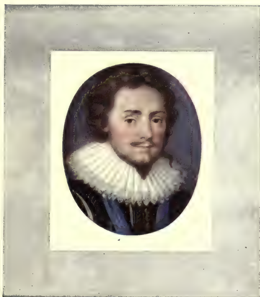
FREDERICK, KING OF BOHEMIA BY ISAAC OLIVER